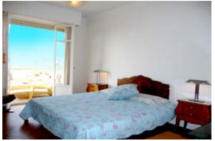
Bedroom – king or twin beds