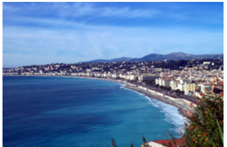
Baie des Anges