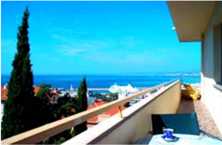
Part of view from the balcony