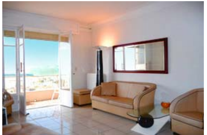
Part of lounge