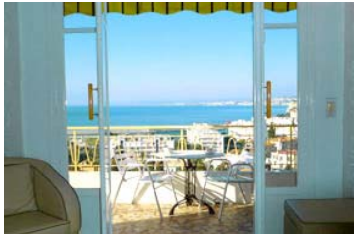
Looking out from lounge