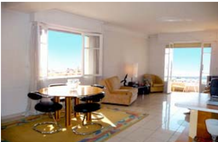
Part of lounge area