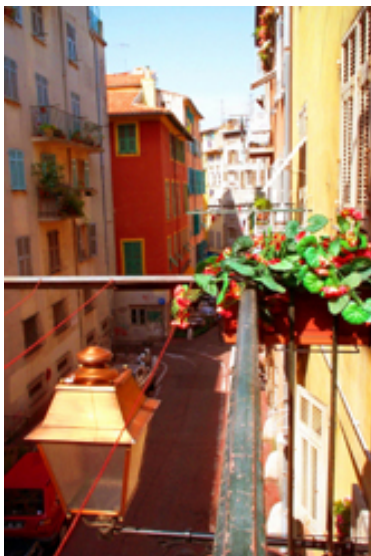
View from balcony and down the street