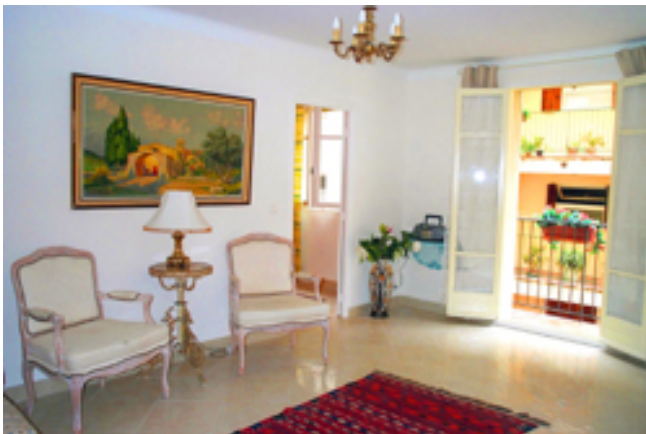
Looking towards balcony and bedroom