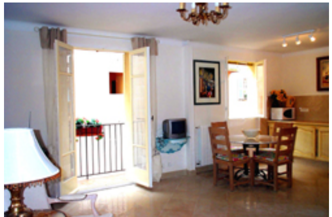
Looking towards balcony and dining area