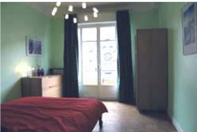
Bedroom 1 – view towards window