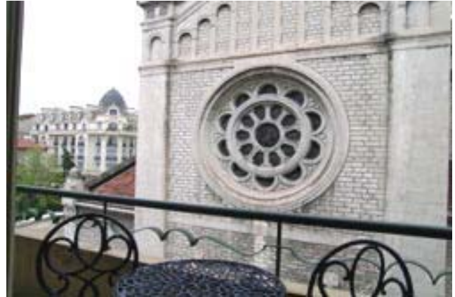
View from lounge balcony