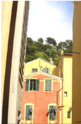
View of the Chateau Hill looking left from each bedroom window