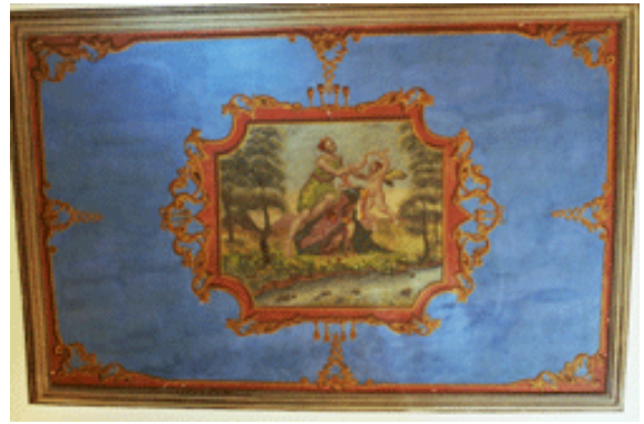
Fresco painting on the ceiling in the lounge. It is estimated to have been painted around 1750